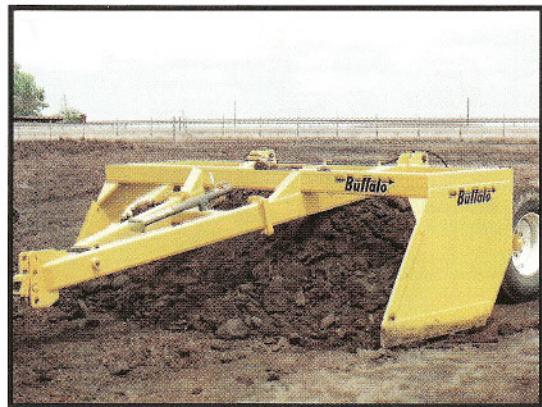
Heavy-Duty Feedyard Scraper holds up to 9 cubic yards of dirt.