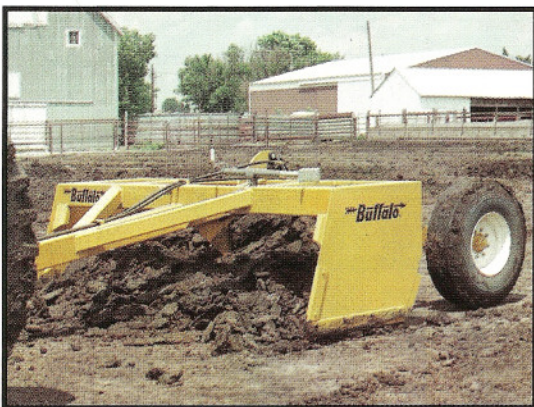
Feedyard Scraper holds up to 6.5 cubic yards of dirt.

The Model 5540 Feedyard Scraper is designed for the needs of those feeders utilizing medium horsepower tractors, but who still require tough, versatile equipment capable of getting the job done.