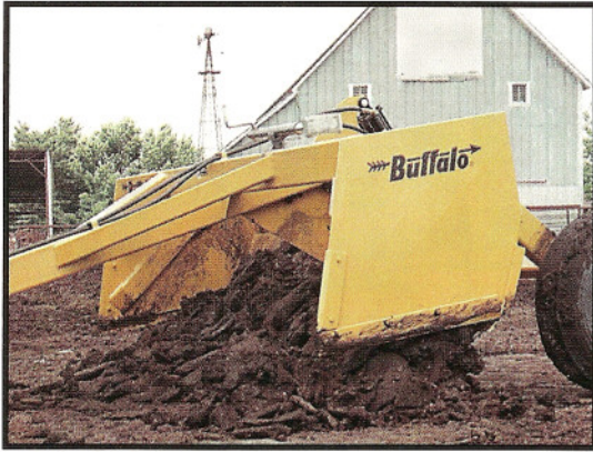
High clearance gives ample dumping height.