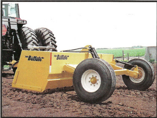
Adjustable tilt axle allows scraper to be lowered on one side for deeper cuts.