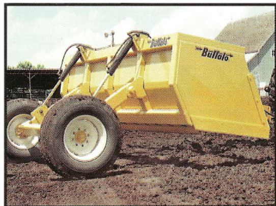
Heavy-Duty Feedyard Scraper comes standard with 3" cylinders and hoses.