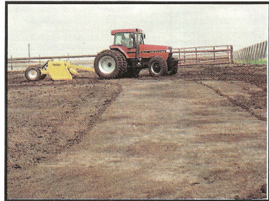
Buffalo Scrapers smooth and finish feedyards quickly and easily.