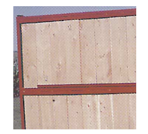
Horizontal top bars, vertical top bars, or solid wood panels available.