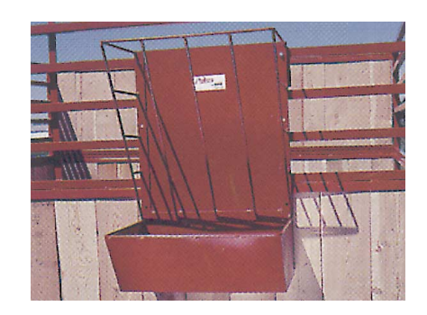
All-steel flat back hay and grain feeder.