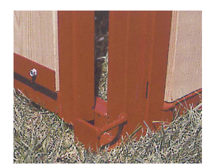
Standard roller-mounted sliding door on all stalls. Swing doors also available.

Professional horseman know that quality portable equipment needs to be durable and practical. That's why so many choose portable horse stalls and accessories from Palco.