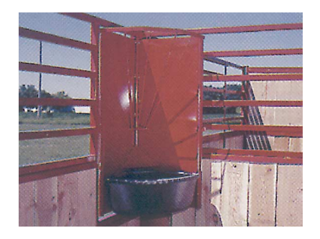
Swing-out hay and grain feeder.