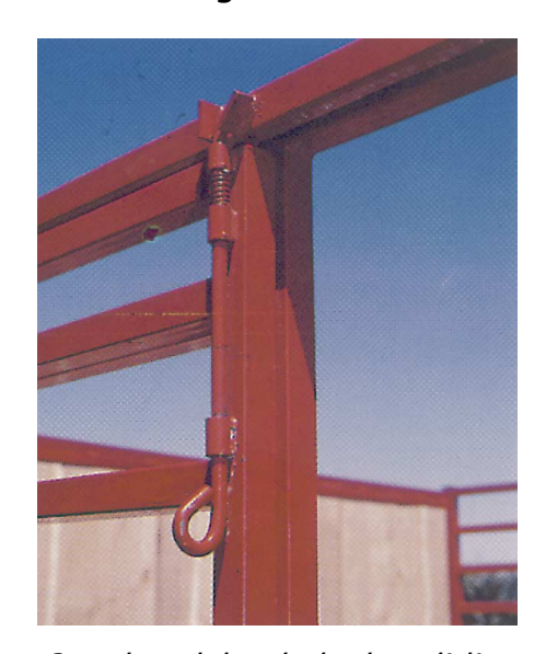
Overhead latch locks sliding door open or closed.

Meeting the Standards of Today's Horseman