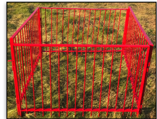
Sheep, Hog and Goat • 4' Spacing between rods • 42' High