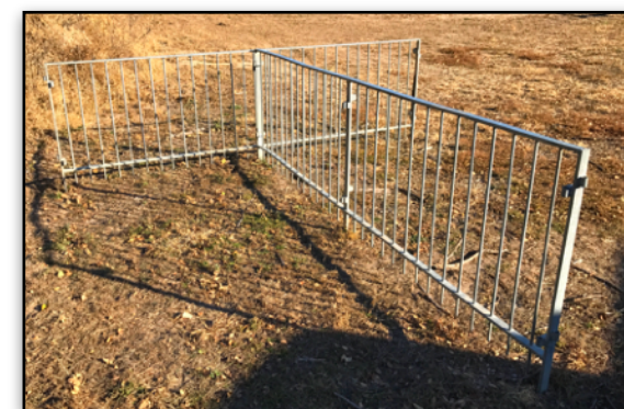
Sheep, Hog and Goat • 4' Spacing between rods • Hot Dip Galvanized • 42' High • 10' Section

Global Equipment Company, Inc. 1001 E Eisenhower Ave p.o. box 1248 Norfolk, NE 68702