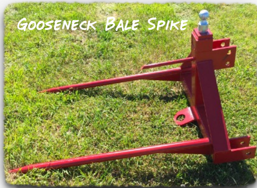
GOOSENECK BALE SPIKE