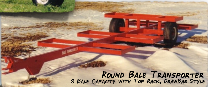
ROUND BALE TRANSPORTER 8 BALE CAPACITY WITH TOP RACK, DRAWBAR STYLE

BALE CRADLE SUPPORT BEAMS USE A PASS THROUGH DESIGN FOR MAXIMUM STRENGTH.