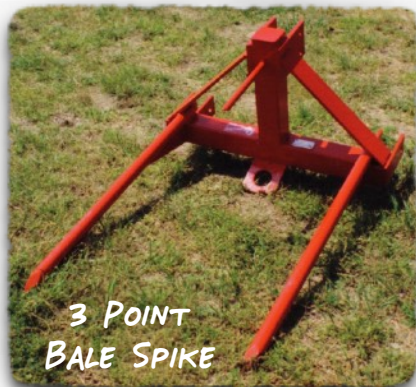
3 POINT BALE SPIKE