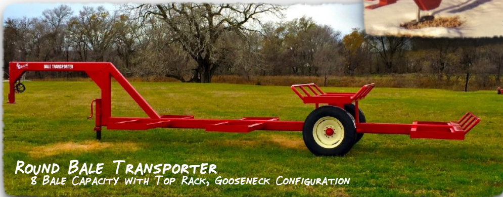
ROUND BALE TRANSPORTER 8 BALE CAPACITY WITH TOP RACK, GOOSENECK CONFIGURATION