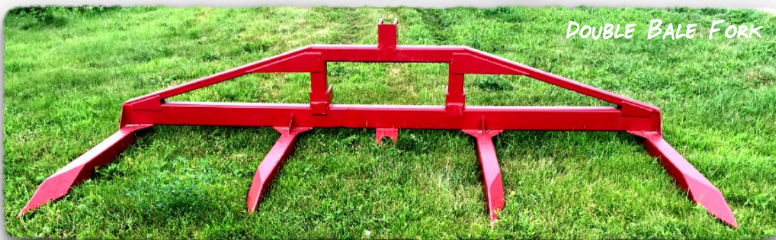
DOUBLE BALE FORK